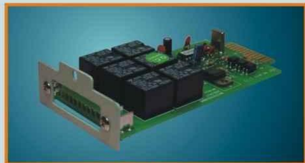
True Relay Interface Card