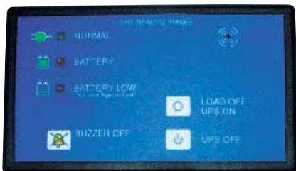
LED remote mimic panel

Note the simple installation: the 10-20kVA can be connected both to single-phase and three-phase mains supplies.