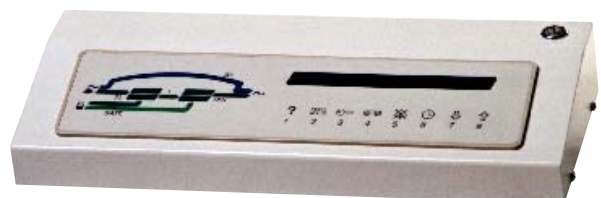
LCD remote panel