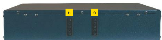
Rear panel Battery box