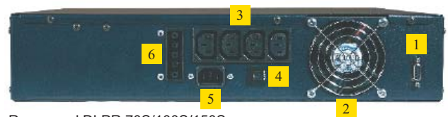
Rear panel DLPR 70S/100S/150S