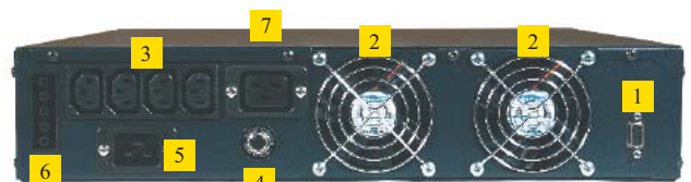
Rear panel DLPR 220ER/300ER